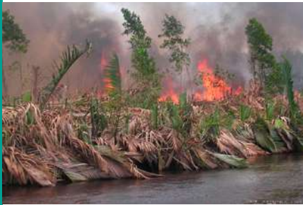
The carbon dioxide emitted during fires in Indonesian peat-swamp forests in 1997 may have been equivalent to 13-40% of global carbon emissions from fossil-fuels in that year